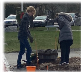
Students from the Hopkinton High School Interact Student Club volunteered to plant the leftover bulbs and plants at the NH Veterans Cemetery.