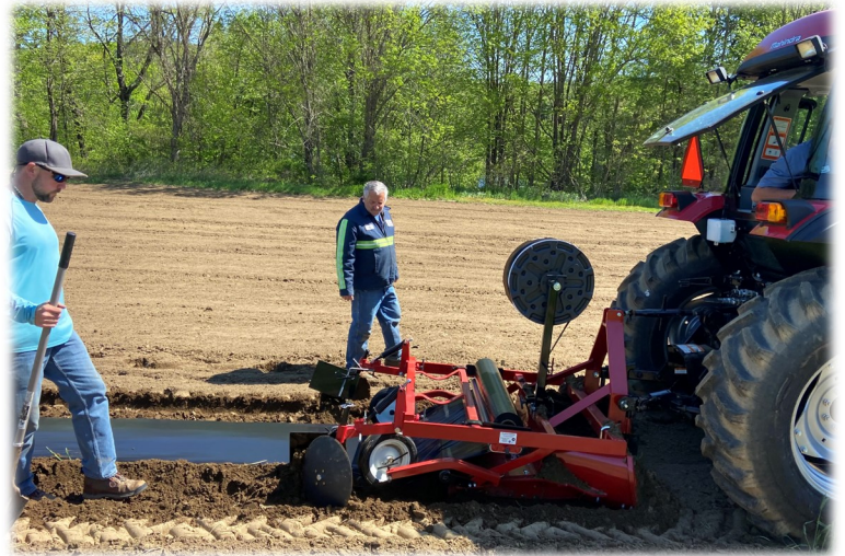
Merrimack County staff laying plastic on the new gardens using MCCC's rentable plastics mulcher